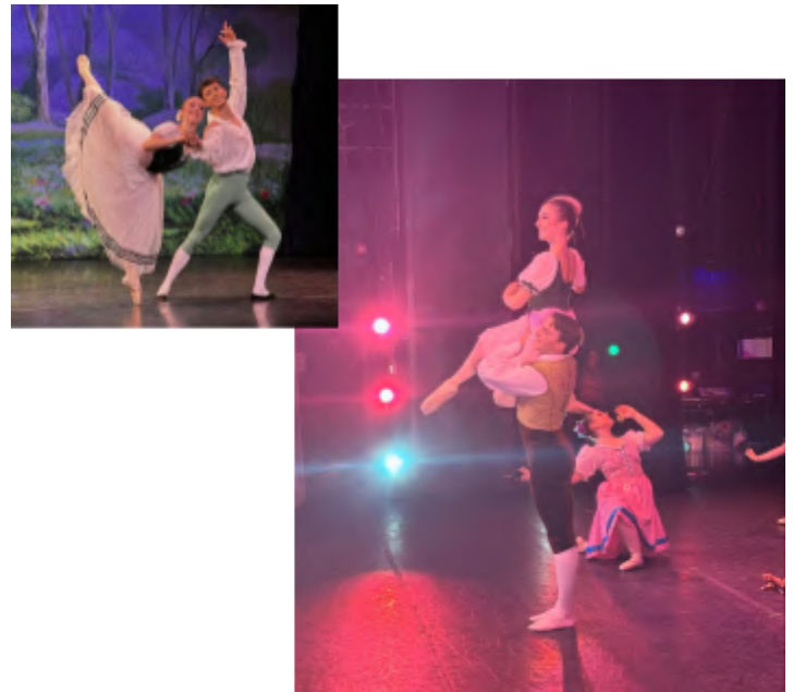
Flower Festival , North Beach School of Dance and The Nutcracker , Ballet Theatre of Maryland