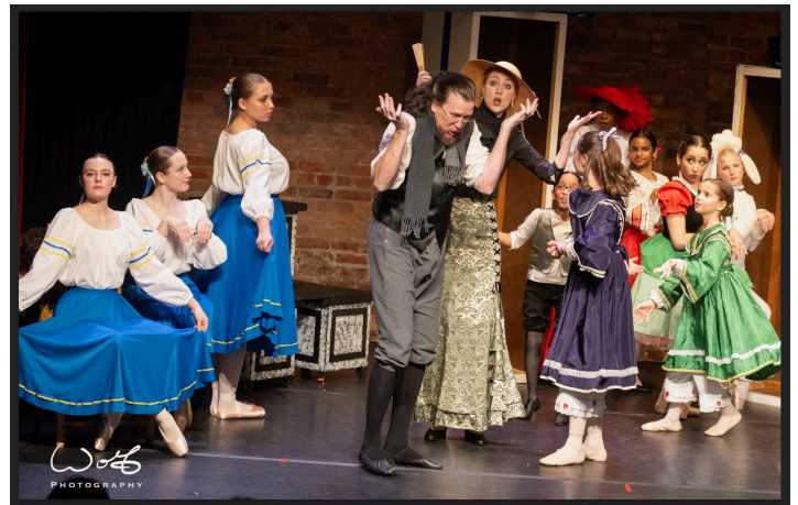
The Wolf and the Toymaker

In the fall of 2024, we had six successful performances of our Storybook Ballet Series at the Halle Cultural Arts Center in Apex. In November, Infinity Ballet Theatre presented The Wolf and the Toymaker , and in December local audiences enjoyed our annual production of Nutcracker Dances .